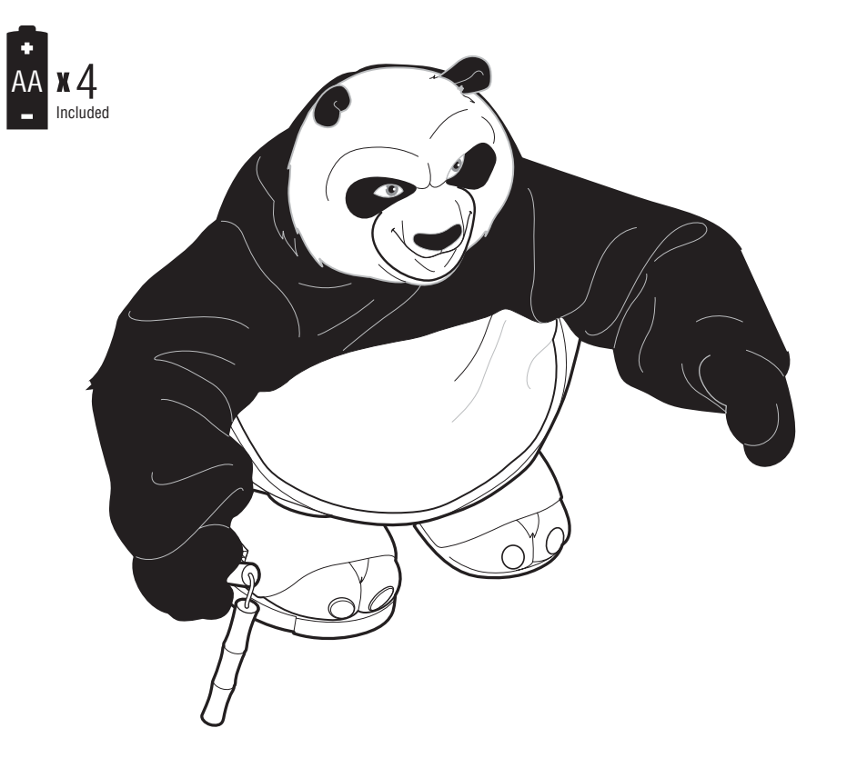
Requires 4 "AA" (LR6) alkaline batteries. Batteries included are for demonstration purposes.

INSTRUCTION SHEET SPECIFICATIONS y: KUNG FU PANDA - MASTER MOVES PO